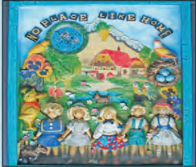
Karen Silver Bloom