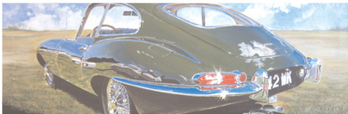
42WK2+2. Acrylic on canvas. 12 x 36 in.