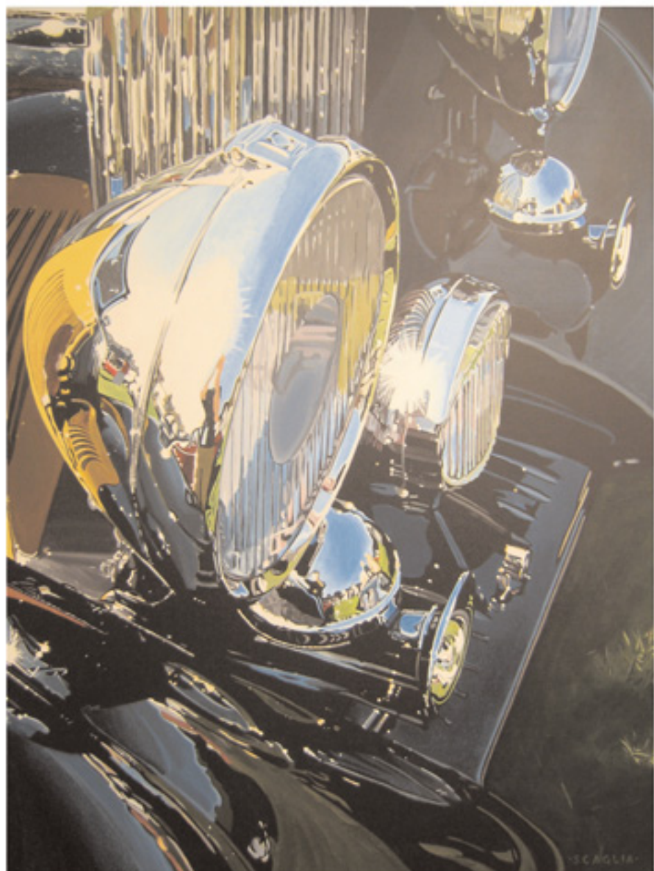
Black and Blue. Acrylic on canvas. 40 x 30 in.

My fascination with detail and different materials suits my resulting photorealistic paintings. I work from my own photographs, cropped and minimally edited to meet my needs for color, form, and composition. Once the view is chosen I set myself the challenge of staying true to the photo from that day and time. My media is acrylic on canvas. I often try to mimic the luscious depth of a car's paint by building up layers of glazed color. One of the most common comments