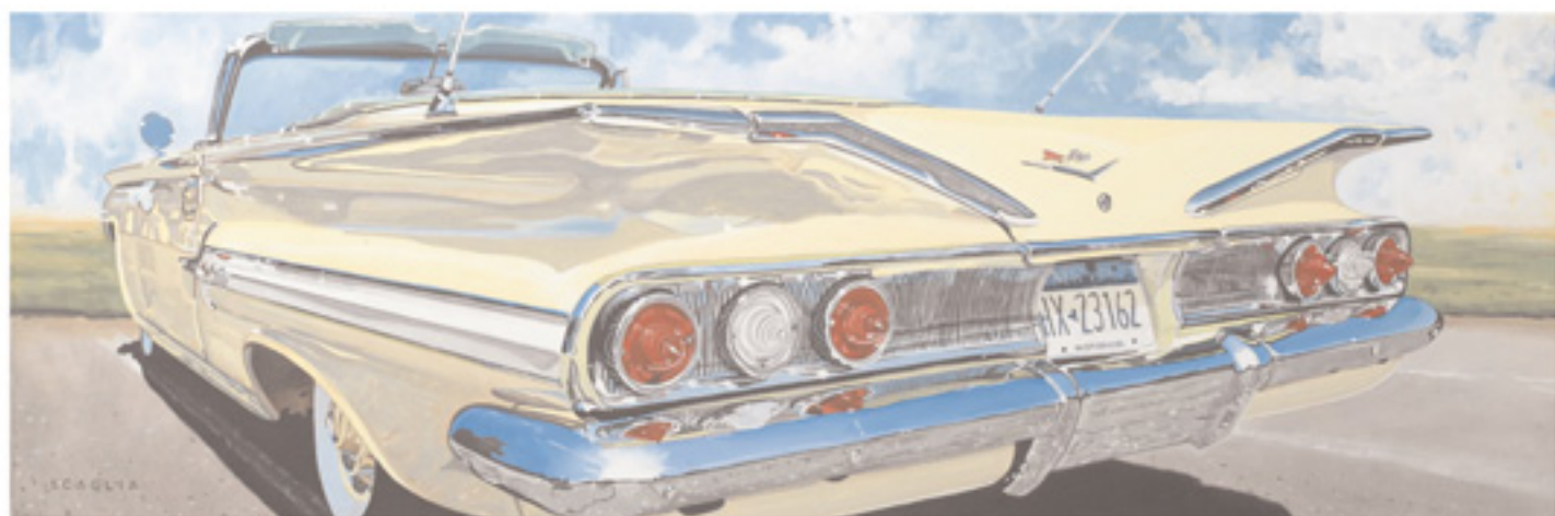
Yellow 60 Impala. Acrylic on canvas. 12 x 36 in.