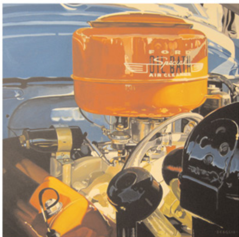
Special Oil Bath. Acrylic on canvas. 30 x 30 in.